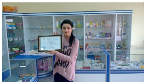
Medical Laboratory Center: Berd, Tavush Region